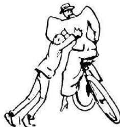
5. "Ow, I'm going."