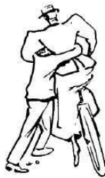
4. "I'm falling, you wretch."