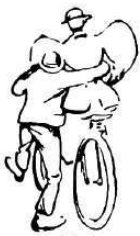
1. "Don't let me fall, George."