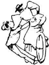
2. "Oh, you feeble idiot."