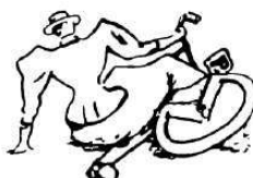
6. " . . . Beast."