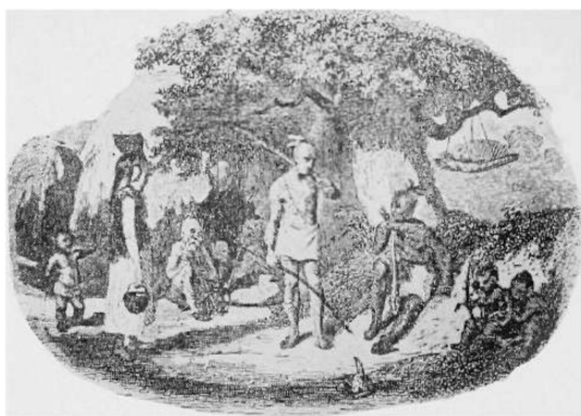
VIGNETTE from the Tours editions

bears a unique title— Carver's Travels in Wisconsin . 9