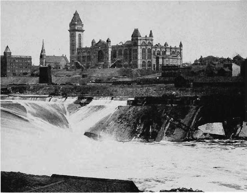
THE Exposition Building and the Mississippi at the Falls of St. Anthony