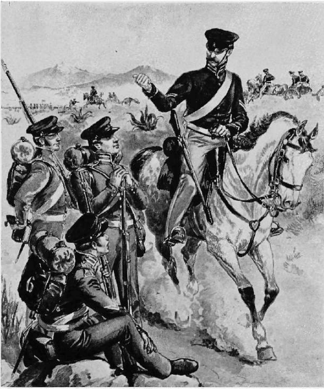
INFANTRY private (seated) in the campaign uniform of the late 1840s

Detroit on June 10, 1848, enlisting in the Sixth Infantry for a five-year period. He was a short man, with blue eyes and sandy hair. His age was twenty-nine, and he listed his occupation as "painter." 2 The circumstances of his enlistment escape us, but his letters give a hint that family troubles and at least a tinge of intemperance may have made him see in the recruiting officer's invitation a chance to escape an uncomfortable situation—to start again, to recoup his self-respect and his family's affections.