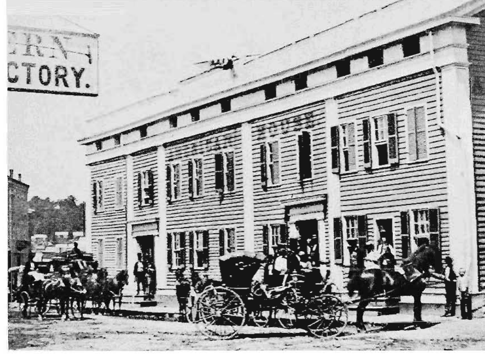
THE American House in 1856