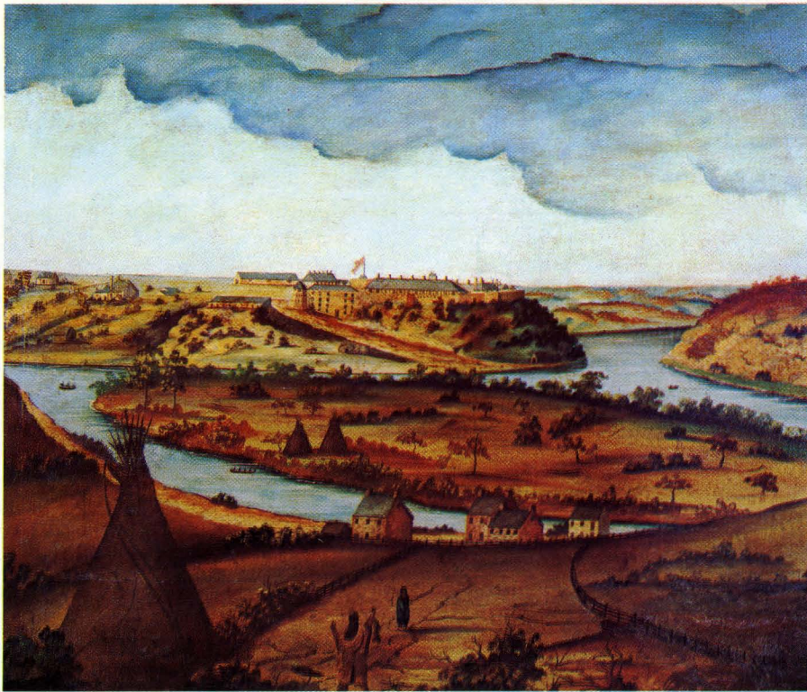
Version in the collection of the Sibley House Association