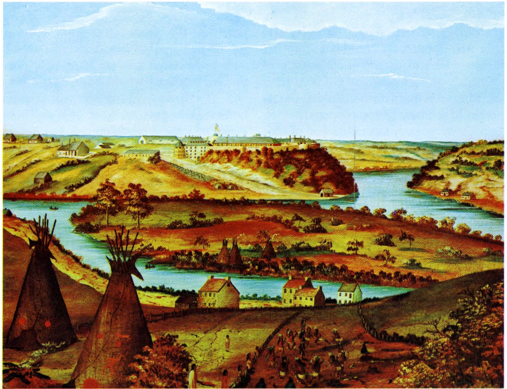
View of Fort Snelling and Mendota owned by the Minneapolis Institute of Arts