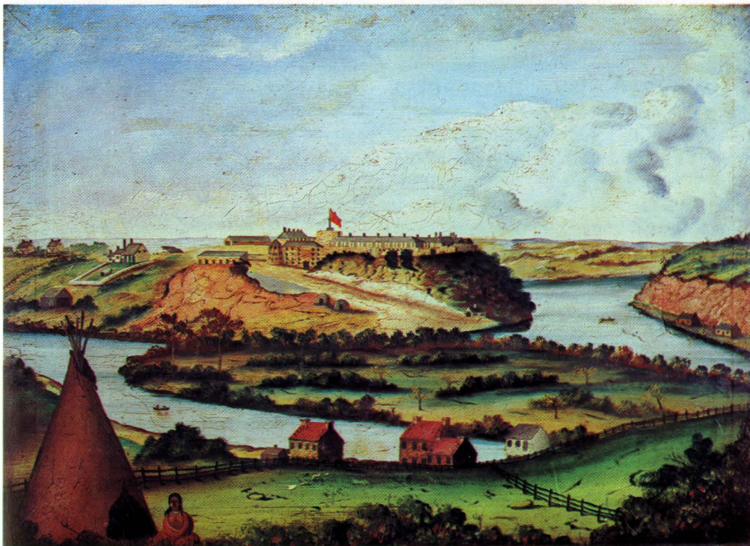
Version owned by the Minnesota Historical Society