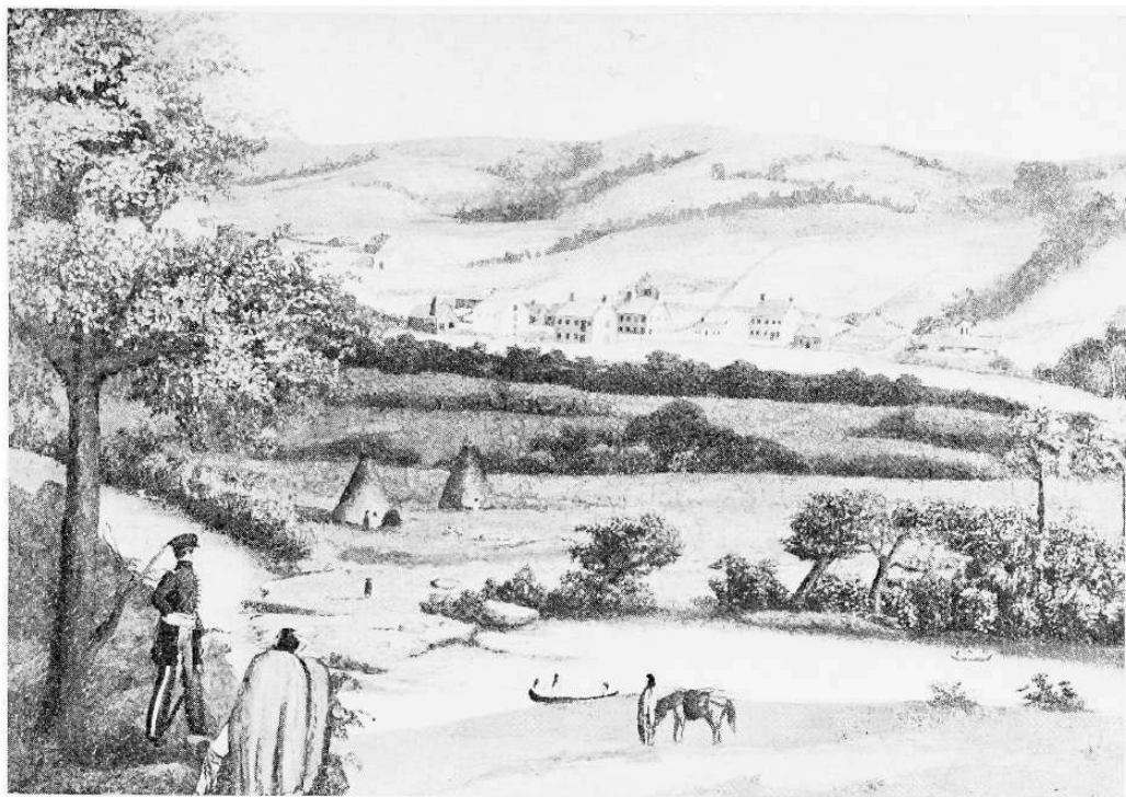
"View of Mendota" which has been attributed to Seth Eastman