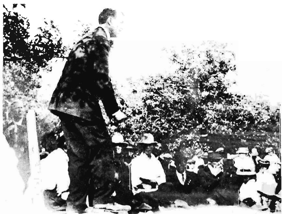
LEAGUE FOUNDER Arthur C. Townley speaking at an outdoor meeting

"CPS Papers; Minnesota in the War, December 15, 1917, p. 4. For typical examples of these news reports with a message, see "The Hun and the Nurse," October 6, 1917, p. 4, and "The Crime of Germany," May 18, 1918, p. 1, and June 1, 1918, p. 5.