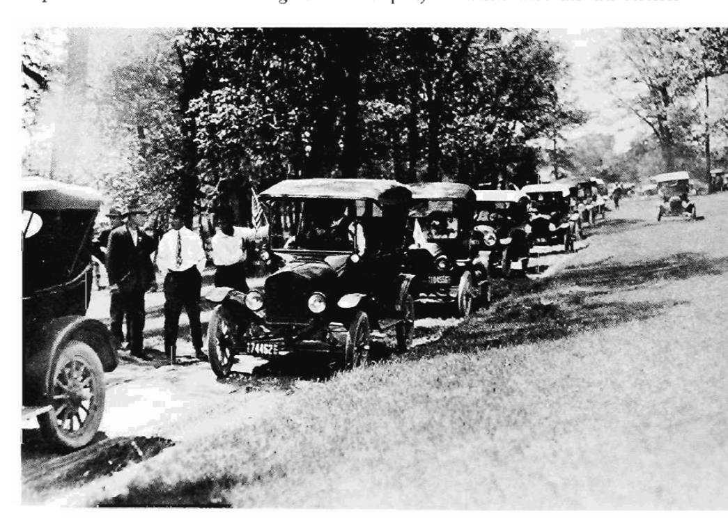
TIN-LIZZIE PARADES, sometimes as long as 700 cars, escorted candidate Lindbergh through rural Minnesota.