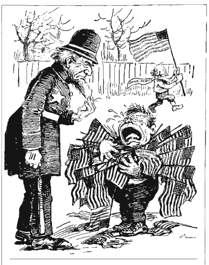
"Boo hoo, make him give me his flag!"