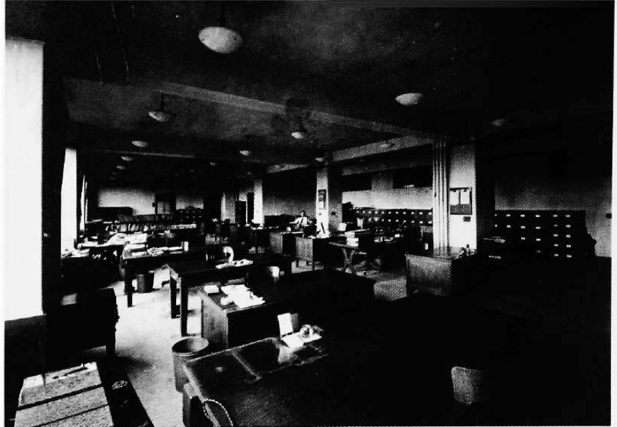
A VIEW of an unidentified office in the Northern Pacific side of the Railroad and Bank Building, probably taken during the 1920s

elevators. The management of the Northern Pacific apparently objected to that idea since employees might “run back and forth between the two buildings,” and furthermore if the employees ate lunch together, they “would be comparing notes as to salaries, conditions under which they worked, etc.” Due to these difficulties, the cafeteria association, at least as late as the 1920s, was not able to obtain a thirteenth-floor opening between the two sides of the building. 8