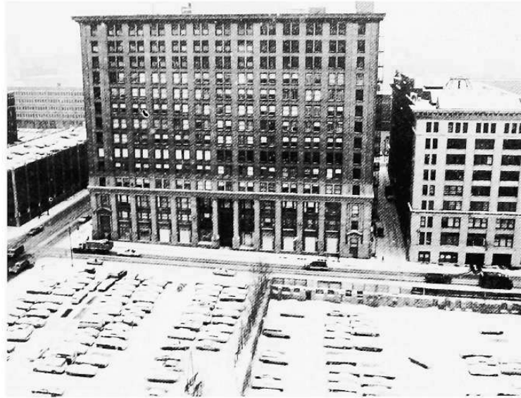
THE BURLINGTON NORTHERN BUILDING, and its neighbor the Nalpak Building, as they looked on a snowy afternoon in January, 1978

To The Heads Of All Departments: August 31, 1917