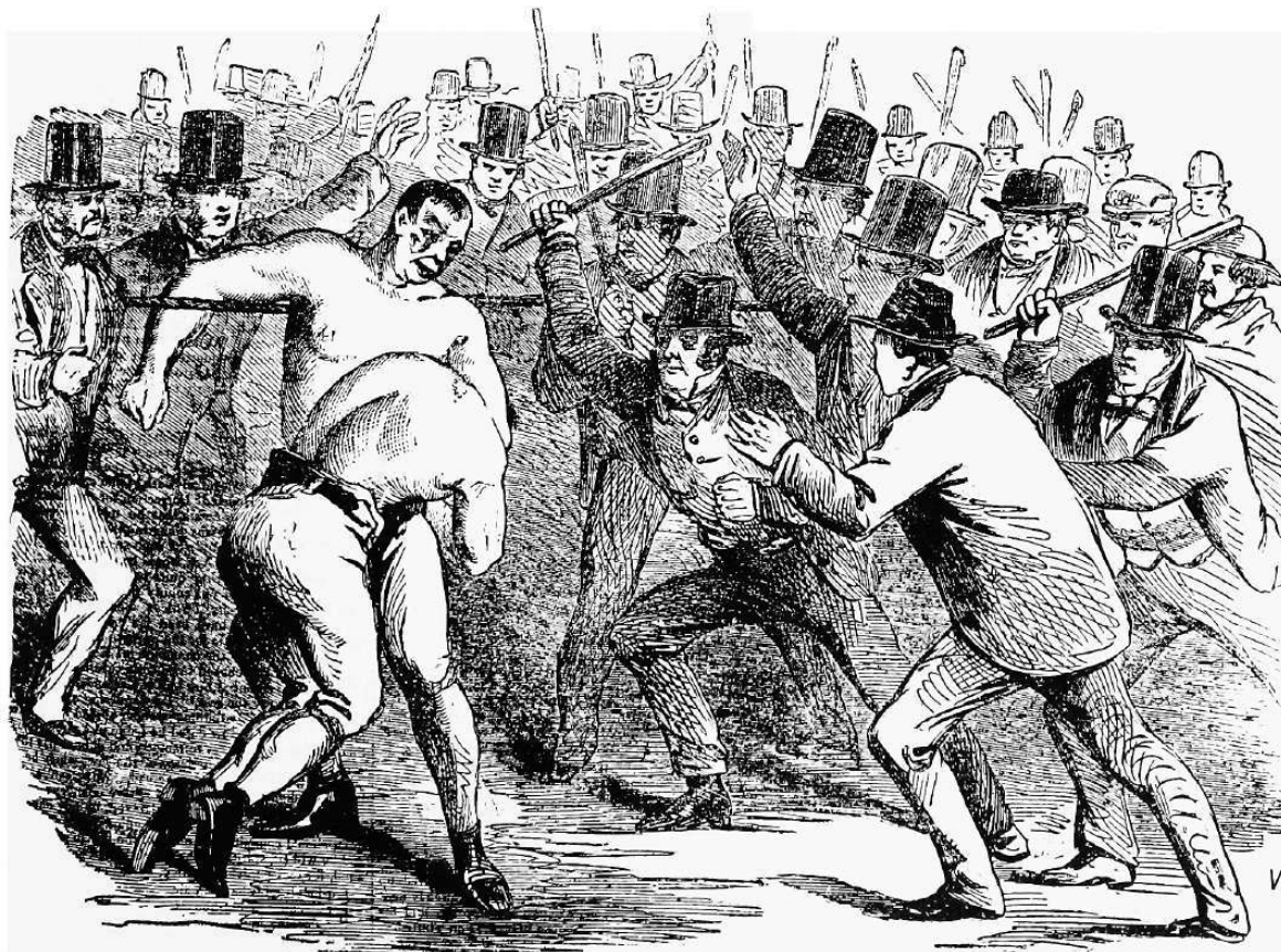
SAYERS against the rope in Round 37 of the championship bout with Heenan

This bipolar attitude toward the ring continued to characterize Minnesota newspapers through the next several decades. Sometimes both poles could be found in the same newspaper, as in the case of the St. Paul