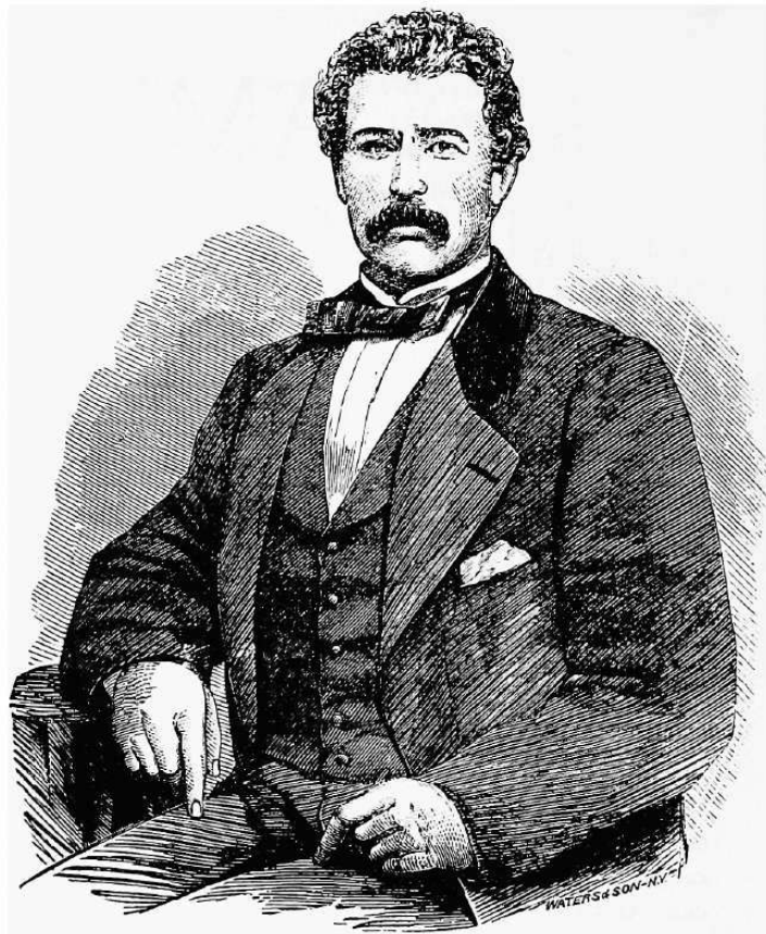
JOHN C. HEENAN, the champion of America

Gazette , after settling on a lurid editorial mix of buxom chorus girls and brawny prize fighters, exceeded 150,000 steady circulation only in the advance and wake of a major fight. 4