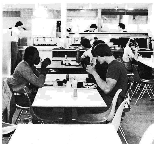
A PEACEFUL lunch at Kise Commons Cafeteria, 1975

Black unity assumed many forms. The Black College Masters competed in intramural basketball and baseball, and an E-Q bowling team participated in campus-sponsored tournaments. Organizations such as the United Black Students, S.O.U.L. (Social Organization for Unity and Leadership), and the Black Women's Organization appeared in 1970 and 1971. These groups formed networks with similar organizations at other state colleges and universities. When a black cultural center at St. John's University in Collegeville opened, Moorhead State students were encouraged to attend a "big Black Weekend" in celebration. S.O.U.L. sent two representatives to a Black Conference Week at Macales-