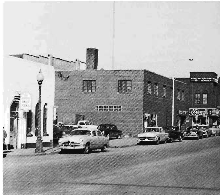
DOWNTOWN Moorhead as it looked in the 1950s

Neither the community nor dissenting students developed any organized attempt to end the program, but negative perceptions and stereotypes heightened the consciousness of being black on a white campus. A black student from Atlanta, Georgia, remembered that "When I first got here it was like a mirage. I'd go downtown, and everybody would be just staring at me; I couldn't help but think, 'Hey, I don't belong in this place.' I stayed in my dormitory room alone all the