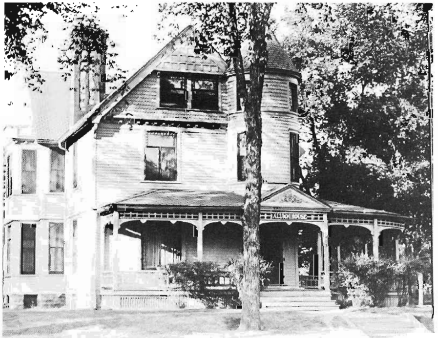
ALUMNI HOUSE at 1495 Hewitt Avenue, St. Paul, as it looked in 1933