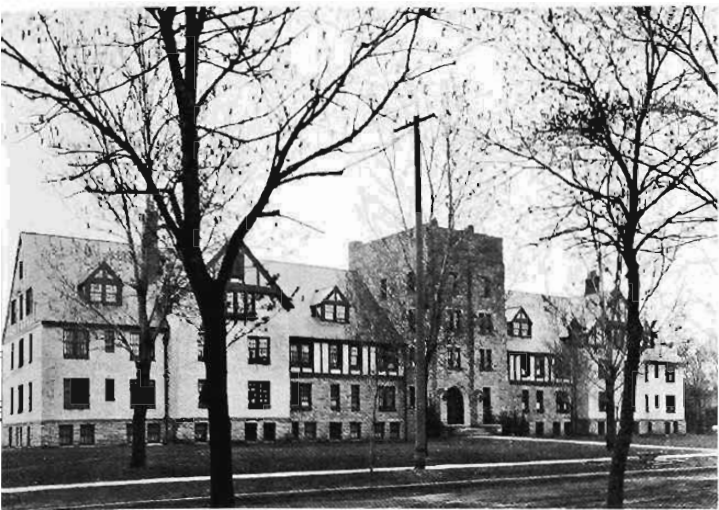
MANOR HOUSE, women's dormitory, in 1925