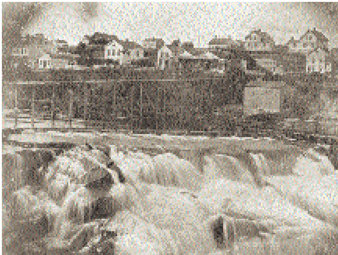
Daguerreotype showing St. Anthony Falls, whose waterpower was quickly harnessed for milling lumber, and the new businesses on St. Anthony’s Main Street, about 1855

Emphasizing climate, health, and agriculture, promoters also praised Minnesota’s water transportation, waterpower, lumbering, scenery, and outdoor sports. In the prerailroad age, navigable waterways were a major concern, and Minnesota’s growth seemed assured because of its location at the head of the Mississippi River and Great Lakes commercial arteries. During the early territorial period, the Missouri River was prominently mentioned, but this stopped as the boundaries of the future state became evident. Promoters had a knack for making all of the Mississippi’s northern