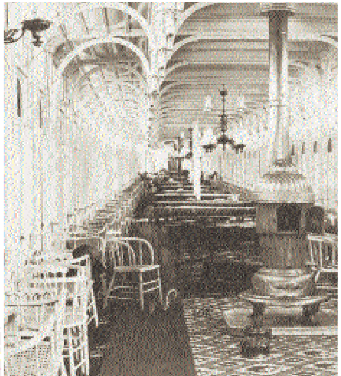
Splendid cabin of the steamboat Milwaukee (right) and the steamers Grey Eagle , Frank Steele , Jeannette Roberts , and Time and Tide at St. Paul's lower levee, 1859

OTHER OFFICIALS who actively promoted Minnesota included Alexander Ramsey and Willis A. Gorman. Ramsey skillfully used his annual messages to the legislature to praise Minnesota's climate, healthfulness, agricultural potential, and future greatness. His words were