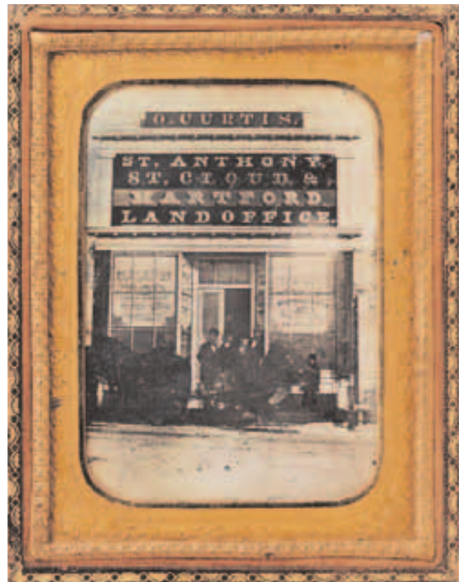
A horse-drawn sleigh waits in front of a busy St. Anthony land office in this 1/4-plate daguerreotype, about 1857.

On a philosophical plane, promoters contended that Minnesota’s climate in fact assured its future greatness. Their proof was the geopolitical notion that the world’s great civilizations had developed in temperate climatic zones. Editor Goodhue, for example, informed his readers that “the human family, never has accomplished anything worthy of note, beside the erection of pyramids, those milestones of ancient centuries, south