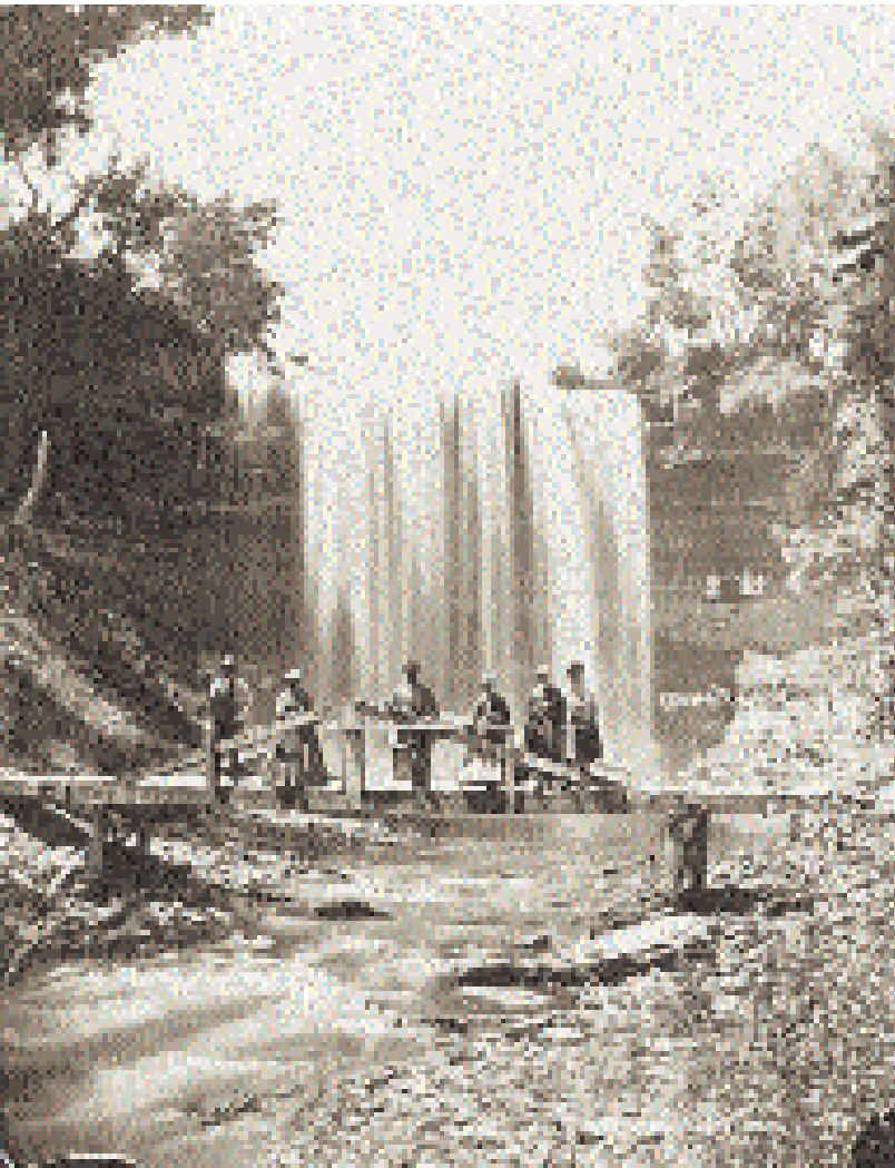
Fashionable visitors admiring Minnehaha Falls, front and back

the visitors departed just before midnight. Speaking at the reception, Fillmore lauded in terms of just praise the scenery and prospects of the country and expatiated at length on its beauty and resources. A newspaper account continued, “He spoke of the adaptation of St. Paul as a summer place of fashionable resort, and believed it would eventually be connected in an unbroken chain of railway with the Atlantic and Pacific Oceans. He should go home with enlarged ideas of the future greatness of Minnesota.” Quite likely he had been made aware that local boosters were predicting greatness for the city because of its central location in the continent.