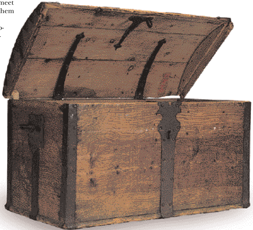
A hand-crafted wooden immigrant's trunk from Norway, 1850s

Speculators and their allies came in many guises, including colonists, land-company agents, townsite promoters, community boosters, and ordinary citizens. Using a pseudonym such as "Northwest," "Benton," or