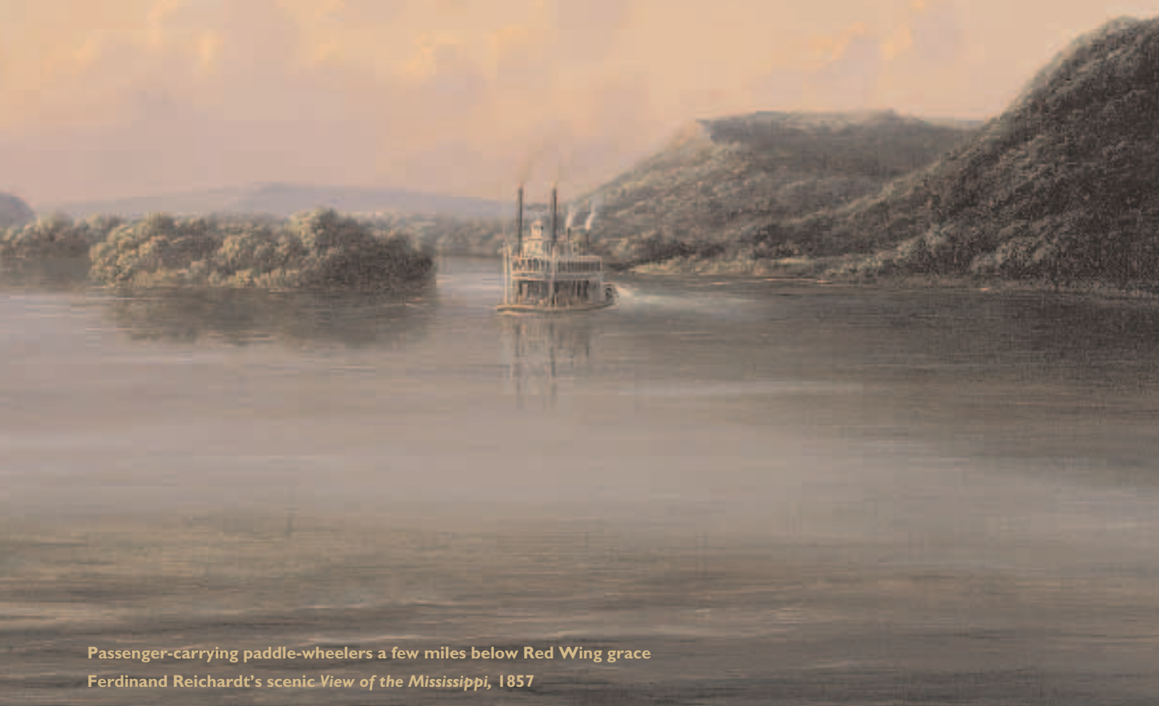
Passenger-carrying paddle-wheelers a few miles below Red Wing grace Ferdinand Reichardt's scenic View of the Mississippi , 1857

Ramsey recognized that the extensive territory, bounded by Wisconsin on the east, Iowa on the south, the Missouri and White Earth Rivers on the west, and British possessions on the north, desperately needed settlers. A census taken in the summer of 1849 showed only 4,535 whites and mixed-bloods living in the territory of about 166,000 square miles (nearly twice the size of the later state). Other than the capital, St. Paul, the only settlements of note were