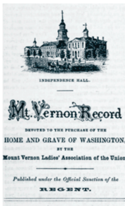
Patriotic imagery drawing on historic preservation from the MVLA's August 1858 issue of the monthly Mount Vernon Record