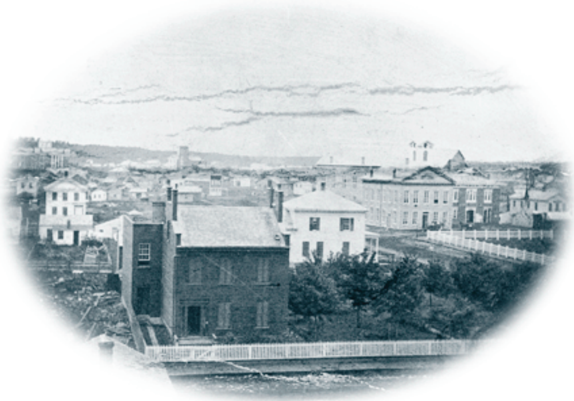
Burgeoning St. Paul, 1859