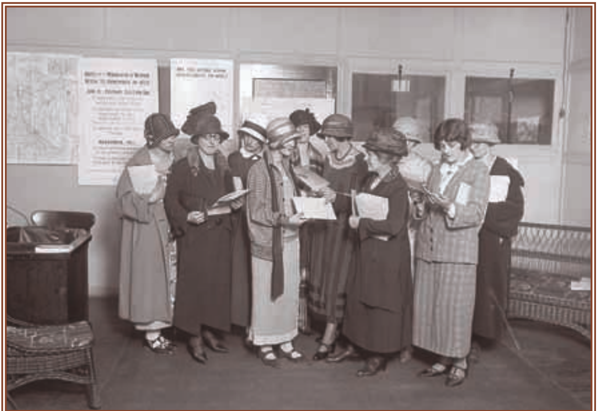
A pre-election gathering of the League of Women Voters of Minneapolis, 1924

The photos on p. 298 and 300 are from Who's Who among Minnesota Women: A History of Woman's Work in Minnesota from Pioneer Days to Date (privately published, 1924); on p. 301 (bottom), from the Minneapolis Journal, May 3, 1914, p. 14. The banners are from the Equal Suffrage Association of Minneapolis; jonquils were a pro-suffrage symbol. All items are in the MHS collections.