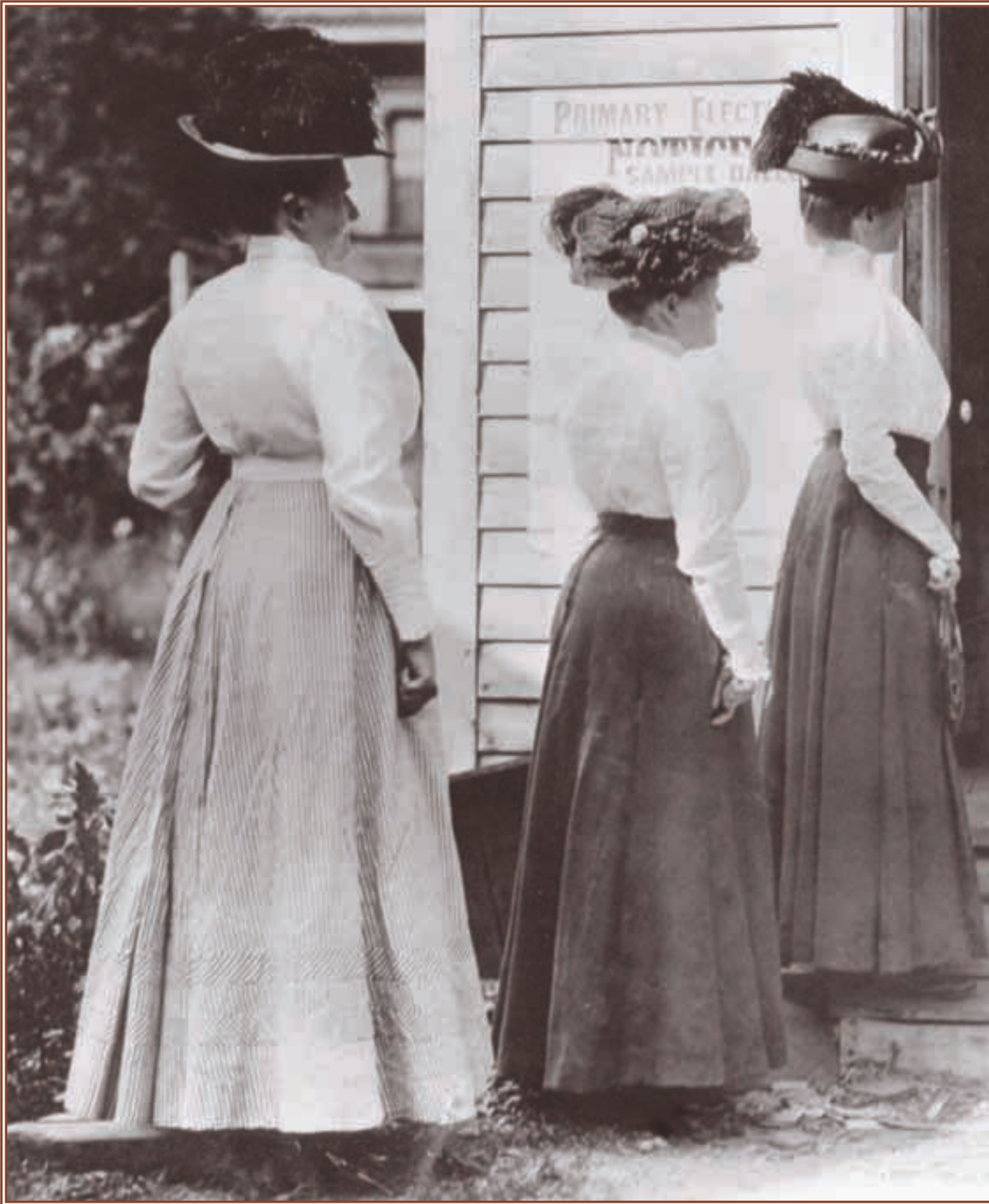
Stillwater women exercising limited right to vote, 1908