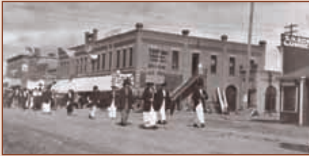
Women parading for suffrage in Madison, Minnesota, wearing male establishment's coats and hats, about 1916

Wyoming, the first suffrage state, granted women the vote when it became a territory in 1869. Between 1890, when it entered the union, and 1896, Colorado, Idaho, and Utah passed amendments to state constitutions authorizing woman suffrage. After a hiatus of 14 more years, Washington broke the suffrage log jam, followed in quick order by California in 1911 and Oregon, Kansas, and Arizona in 1912. One year later,