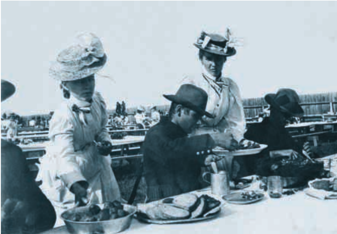
The Twelfth Regiment, Minnesota Volunteer Infantry was welcomed home with a bountiful dinner at the Brown County fairgrounds in New Ulm , September 1898. Composed mostly of men from southern Minnesota, the regiment spent the war drilling in Georgia and Kentucky.