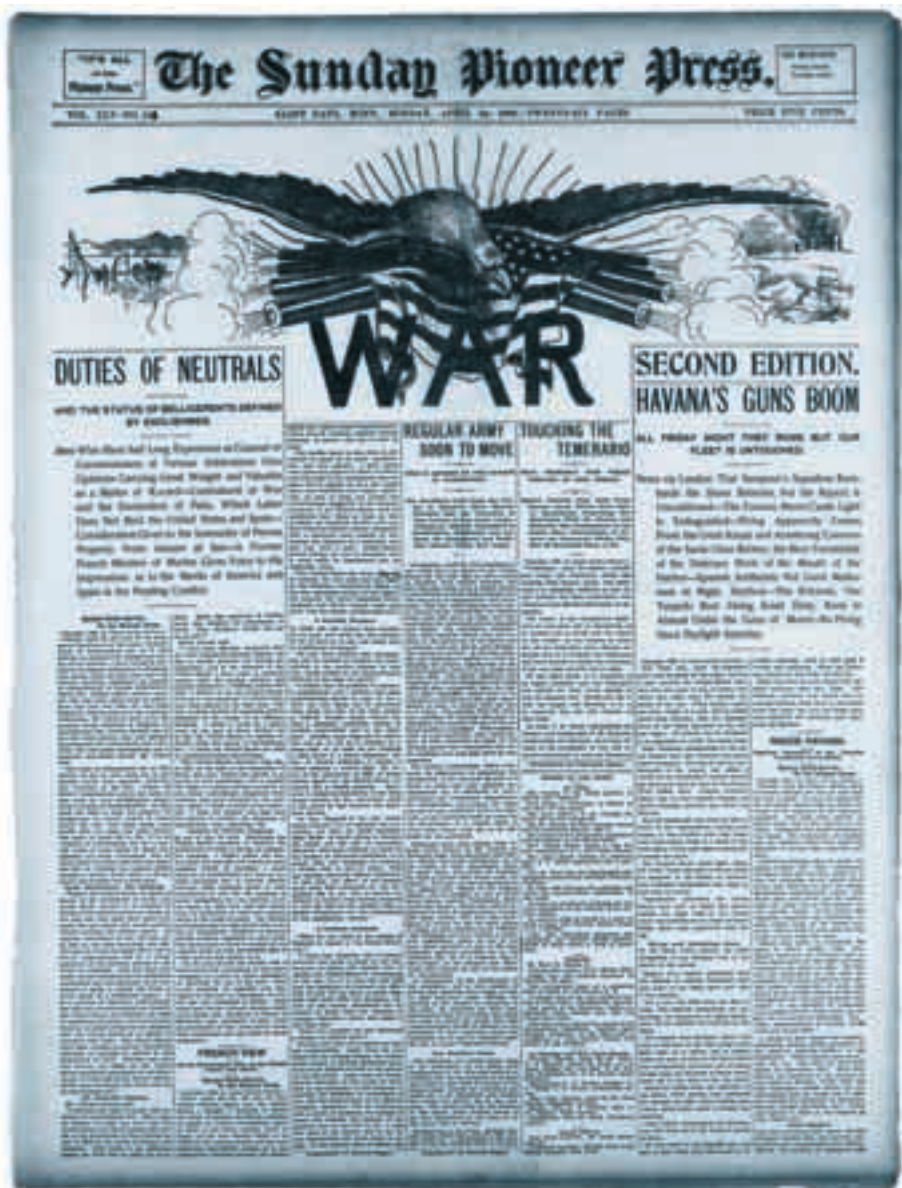
Front page of St. Paul's Pioneer Press, Sunday, April 24, 1898, the day before Congress officially ratified the declaration of war

In 1898 Minnesotans were still recovering from the financial panic of 1893 and were looking forward to prosperity, not a war. But as the nineteenth century drew to a close, American ex-