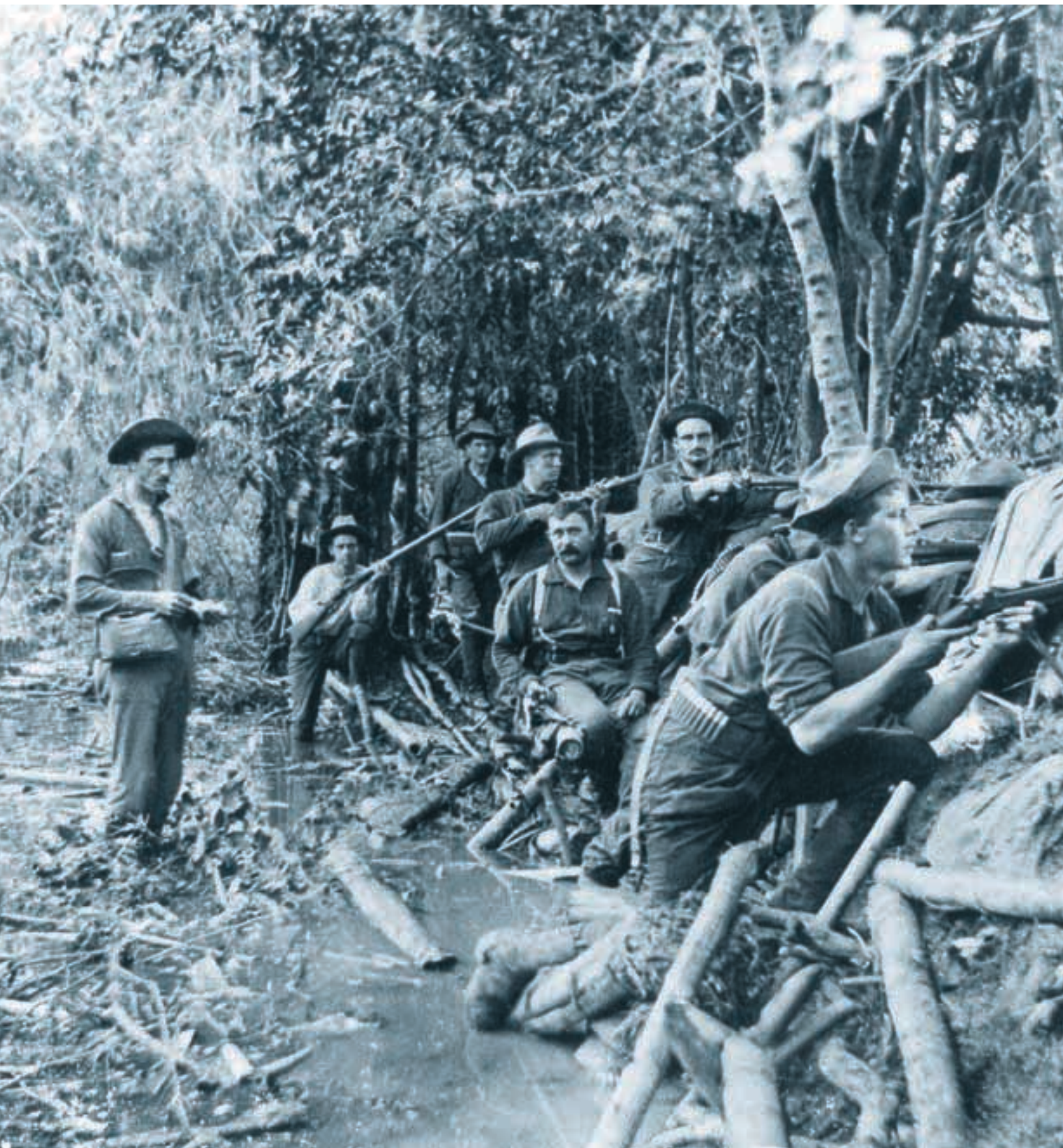
Members of the Thirteenth Minnesota in trenches around Manila, August 1898