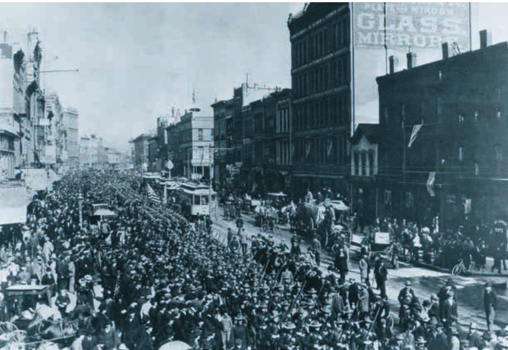
Philippines-bound Thirteenth Minnesota Volunteer Regiment marching past well-wishers down Minneapolis's Washington Avenue, May 1898