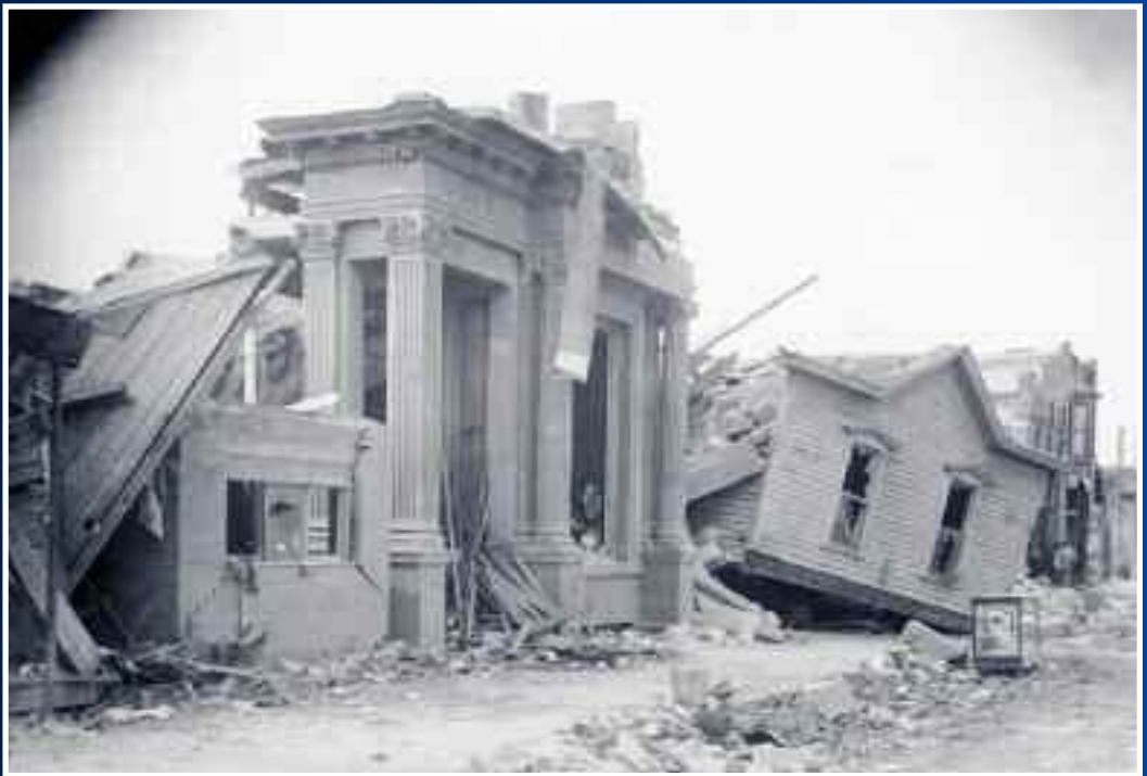
Positioned at the northernmost end of Tornado Alley, Minnesota ranks 18th nationwide in annual tornados, averaging 18 per year. At 9:20 P.M. on August 21, 1918, a tornado leveled Main Street in southwestern Minnesota's Tyler in two minutes.