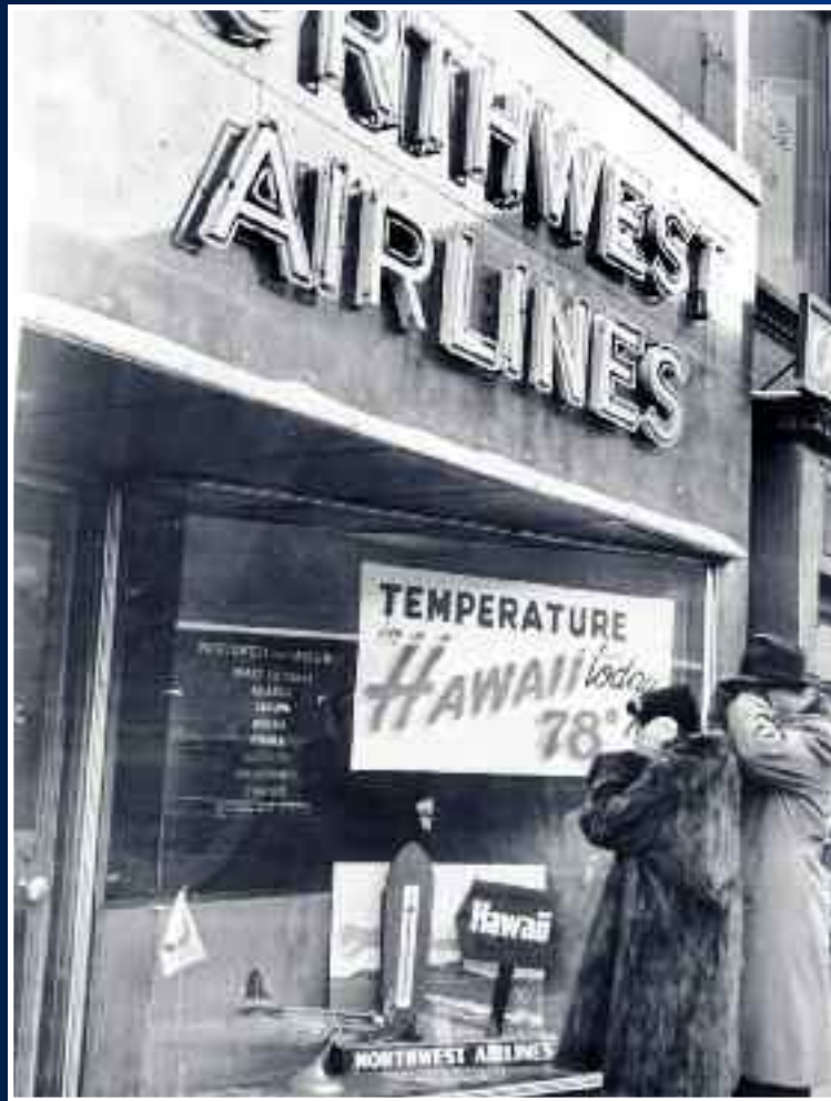
Window shoppers dreamed about Hawaii during the season's worst cold snap, 1951