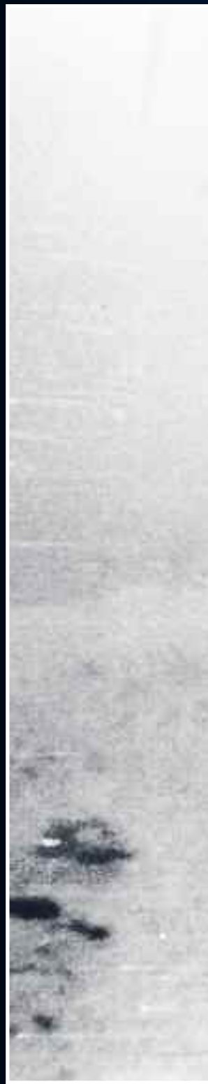
In a state where an ice-fishing seminar can attract more than 1,000 people, it has been said that the sport is more popular than bowling and lutefisk potlucks combined. This angler enjoyed his ice-fishing house on one of Minnesota's 11,842 lakes in January 1953.