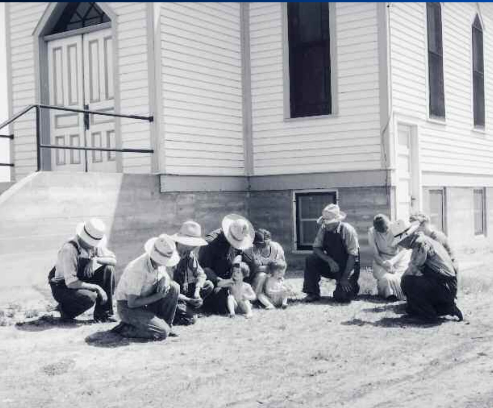
In July 1936 Minnesota towns recorded 13 straight days of 100-degree-plus temperatures and no rain. Holden Norwegian Lutheran Church members near Beardsley prayed for a break in the drought.