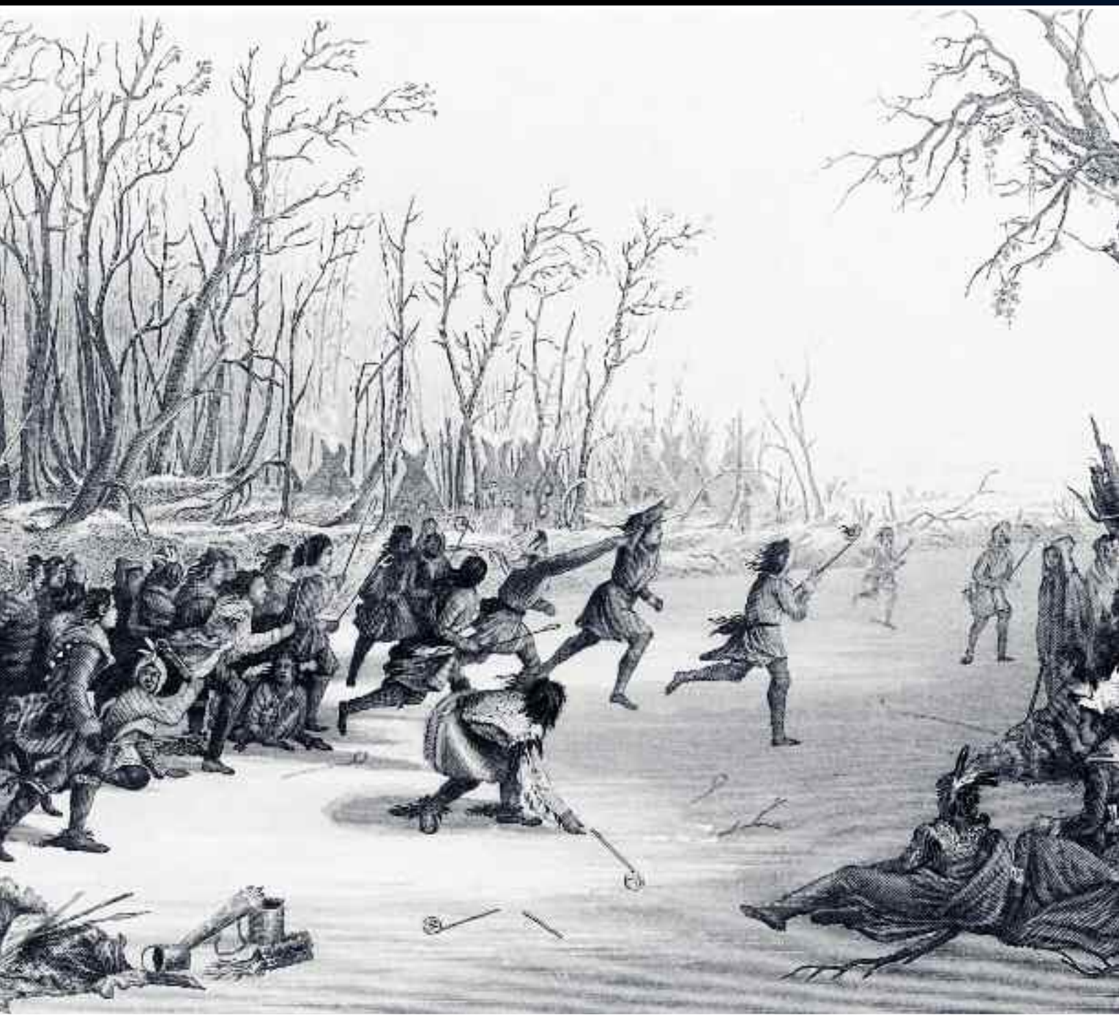
Long before immigrants introduced skating, curling, and hockey to Minnesota, Indians played their own games on the region's frozen lakes and rivers. (Engraving by Seth Eastman, Ball Play of the Dahcota [Sioux] Indians , 1850)