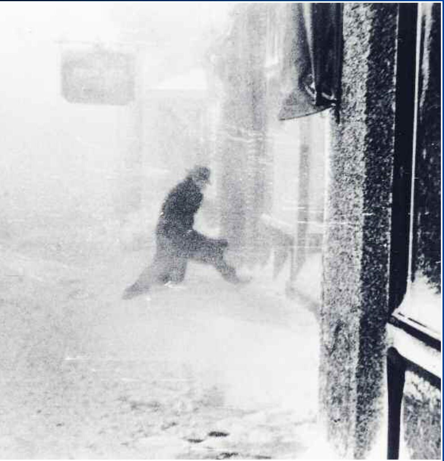
Armistice Day Blizzard, 1940, in Watkins