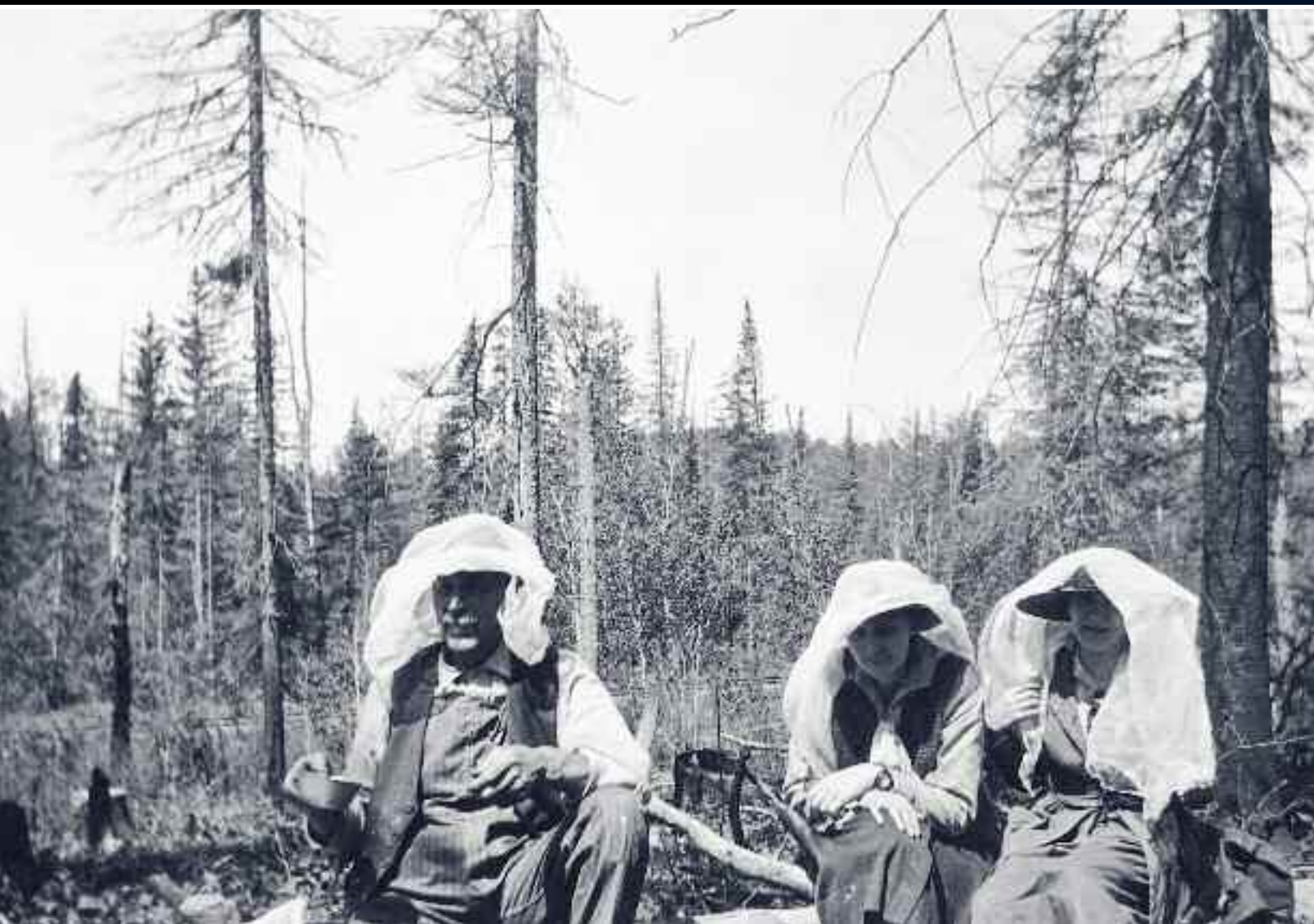
The state's tourist bureau played down Minnesota's undesirable features—frigid winters and hot, mosquito-plagued summers—but the uncensored caption on the back of this July 1918 photograph reads: "Hot tea, hot day, mosquitoes, deer flies, no fish."