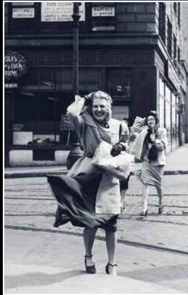
Above: Minnesota's maximum wind gust is 110 miles per hour, recorded during a Twin Cities tornado in August 1904. These pedestrians fought the wind on St. Paul's Fourth and Wabasha Streets in April 1948.