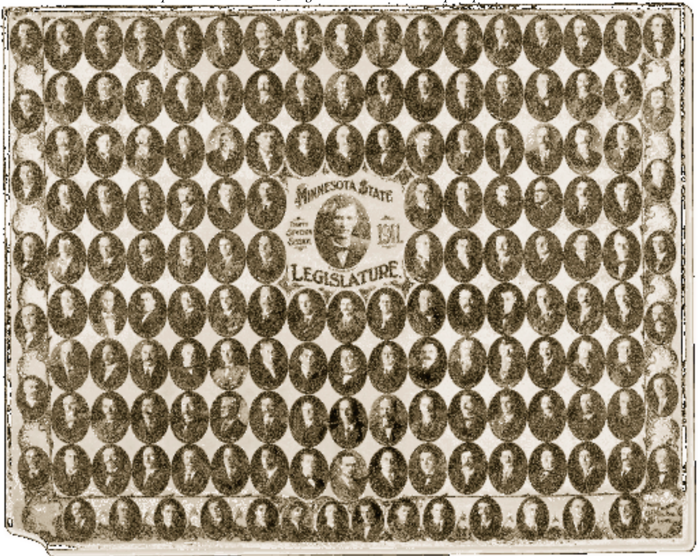
Governor Adolph Eberhart and the 1911 legislature that outlawed capital punishment in Minnesota

St. Paul Pioneer Press , St. Paul Dispatch , and St. Paul Daily News —were criminally indicted. Although the papers were found guilty of the misdemeanor and fined $25.00 each, the newspaper accounts ensured that Williams was the last person to be executed in Minnesota. Public outrage caused governors to commute all subsequent death-penalty sentences until capital punishment was abolished five years later, in 1911, by the Minnesota legislature. 11