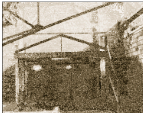
Scaffold inside the Hennepin County jail, 1895

The jail description is from Williams, A History of the City of Saint Paul to 1875 (1876; reprint, St. Paul: Minnesota Historical Society Press, 1983), 281.