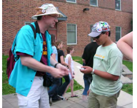
Life on Campus