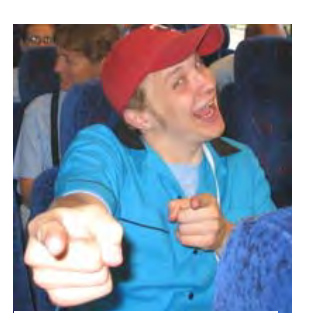
Best Earring: Ott